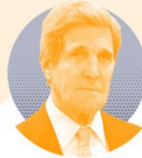
JOHN KERRY Special Presidential Envoy for Climate

This is a new cabinet role that will focus on international cooperation to address climate change.