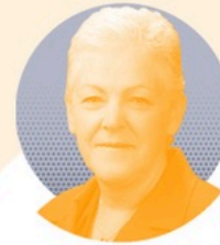
GINA McCARTHY White House Climate Czar

This is a new cabinet role that will focus on international cooperation to address climate change.