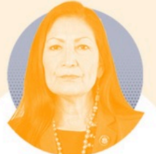
DEB HAALAND Secretary of the Interior

The former governor of Michigan will help speed up the transition to EVs, among other plans.