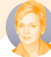
JENNIFER GRANHOLM Secretary of Energy

Will be in charge of environmental policy for the Biden administration.